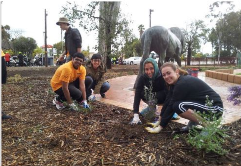
Volunteer: Curtin University students planting native shrubs at Pioneer Park.

MERREDIN welcomed 11 students from Curtin University recently as part of the John Curtin Weekend programme, which sees more than 500 students travelling throughout WA to complete acts of community service.