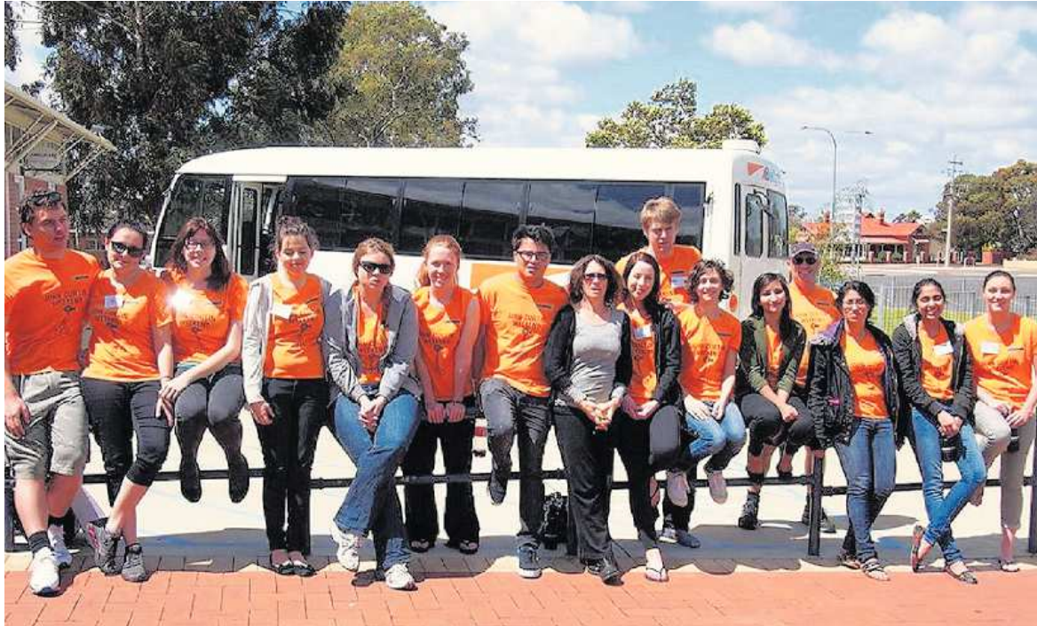
Curtin University student ambassadors help beautify Narrogin, as part of the John Curtin Weekend.